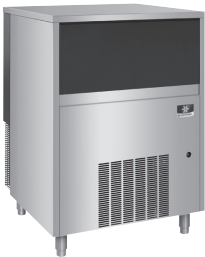
UFP0350 undercounter height