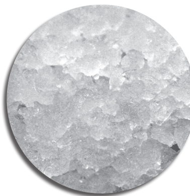
Ice shown actual size