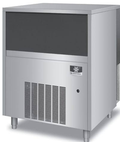
Model UFP0350A Flake Ice Machine