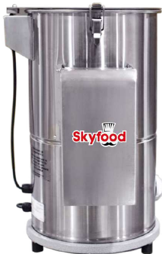
DB-6 POTATO PEELER