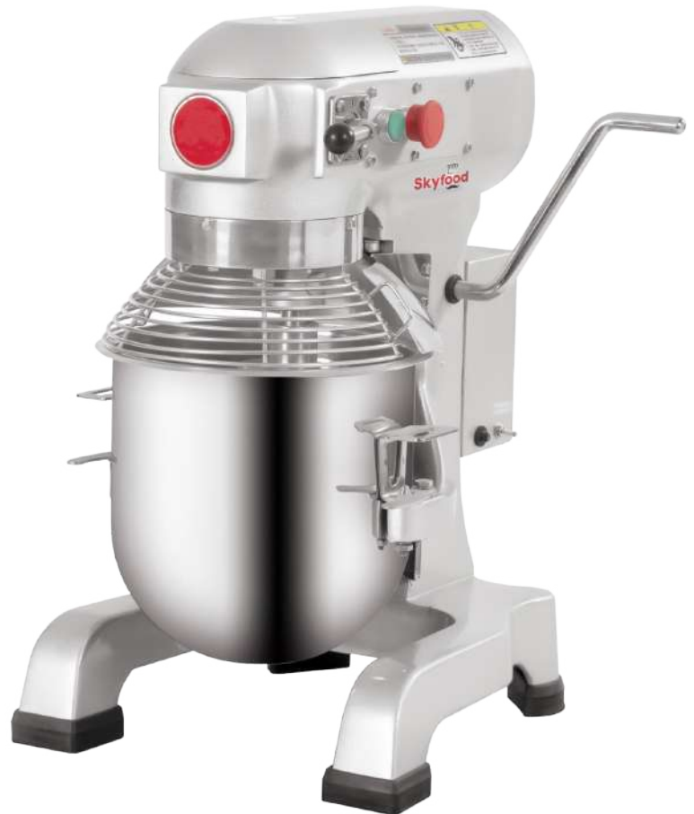
SMM10 10 qt Planetary Mixer

Conforms to the following Standards: ETL electrical and sanitation (under UL, CSA and NSF Standards).