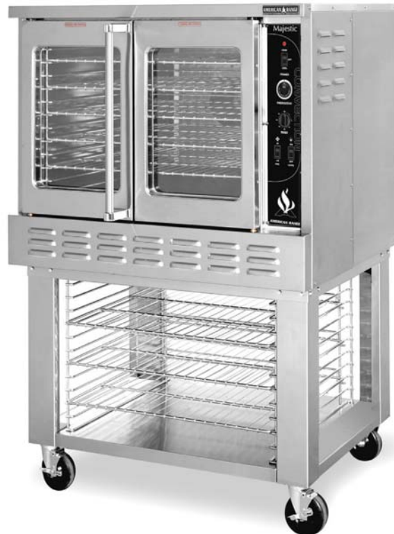
Shown with optional glass door & computerized control

American Range presents a new series of heavy duty majestic convection ovens. All stainless steel exterior construction for robust durability. Unique oven cavity baffle system provides maximum efficiency. Large size oven cavity is designed to accommodate full size sheet pans front to back or side to side. 5 racks with 12 positions allow for maximum capacity along with enhanced flexibility. Stainless steel burners w/75,000 & 90,000 BTU/hr. provide rapid heat and recovery. Two 40 watt oven lights provide improved visibility of the interior. Designed and built to provide superior performance and durability.