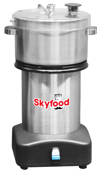
CR-4 VERTICAL CUTTER MIXER