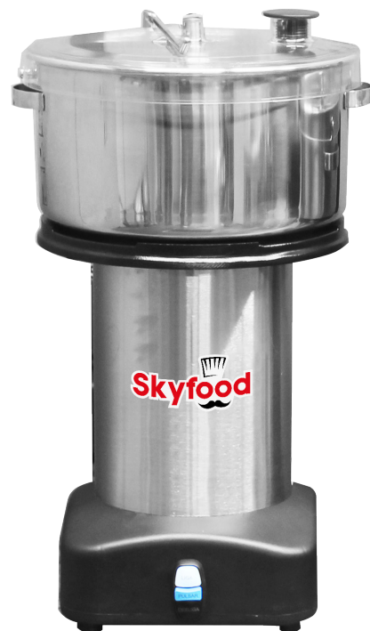
CR-8 VERTICAL CUTTER MIXER