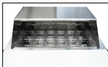
Removable cover with slide back lid

This product is equipped with a fine mesh filter to the front of the condenser to catch dust, and a rotating brush that moves up and down daily to remove excess buildup outward and away.