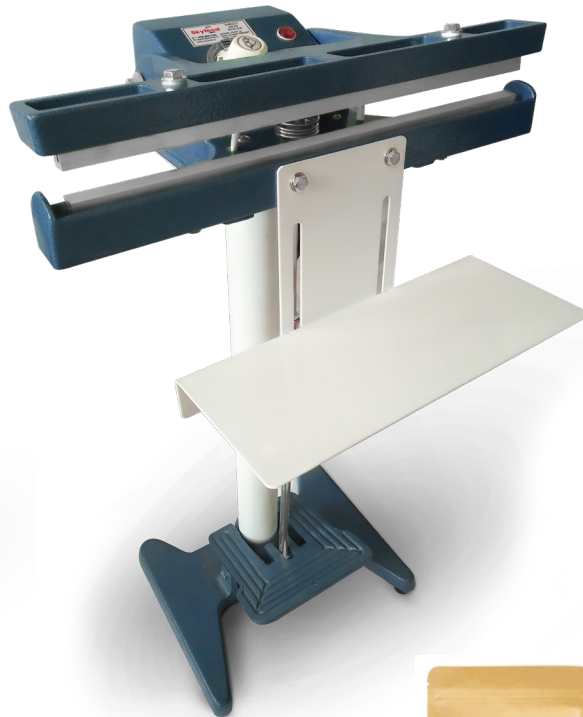
DHSF-45 18" DIRECT HEAT SEALER