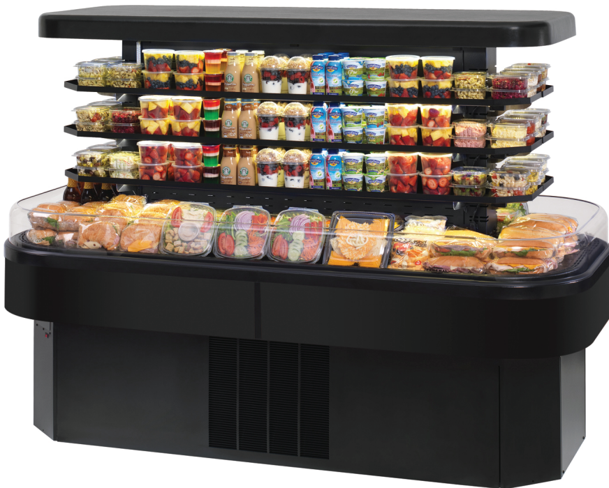
Model EIMSS84SC-3 Shown *Black Exterior Finish Only

Designed with impulse sales in mind. Get maximum return and increased profits with shop-around merchandising.