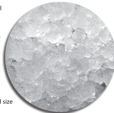
Ice shown actual size

Flake ice is small hard bits of ice ideally suited for presentation applications.