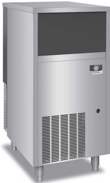
Model UFP0200A Flake Ice Machine