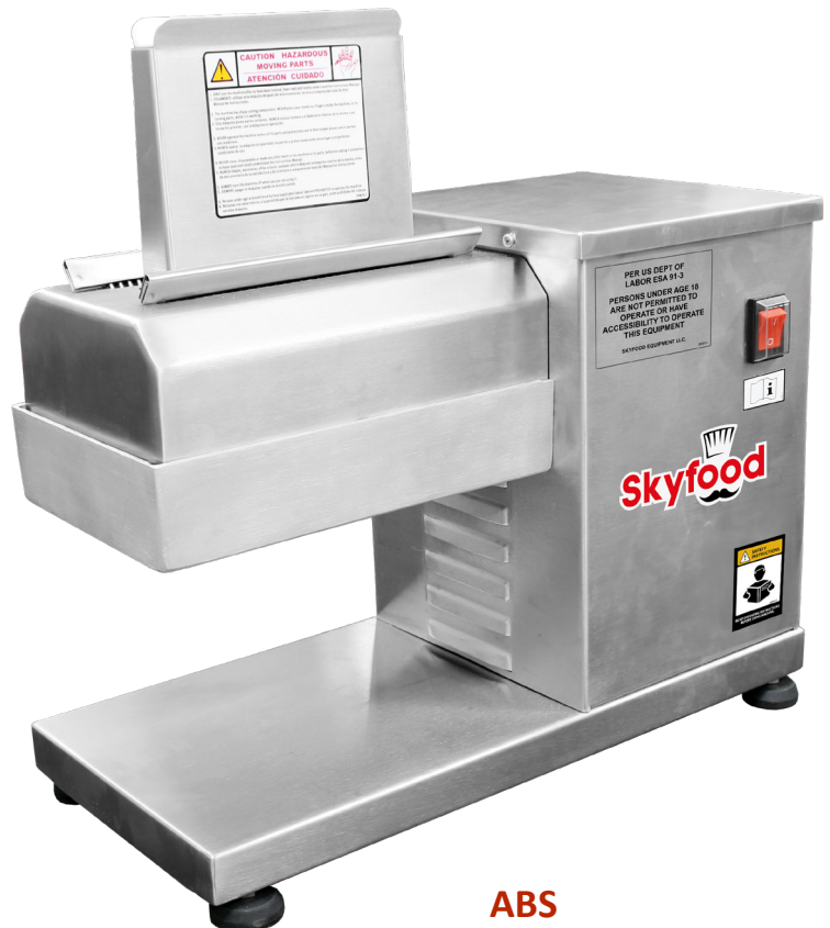
ABS Meat Tenderizer