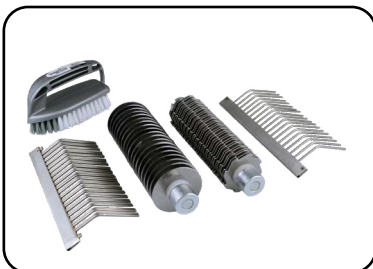
Accessories for ABS KES-ABS10 Strip cutter / Fajita Blade Set 3/8" ABS