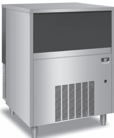
Model UNP0300A Nugget Ice Machine