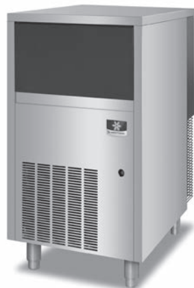
Model UNP0200A Nugget Ice Machine