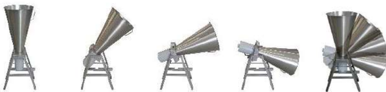
TILTING CONTAINER FOR EASY DISCHARGE